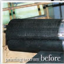
printing tectrum before