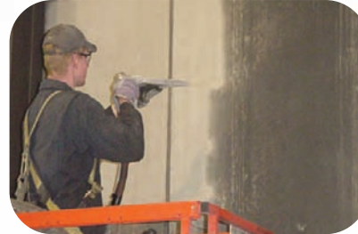
fire damage - soot on concrete