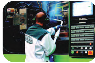
maintenance - machine cleaning