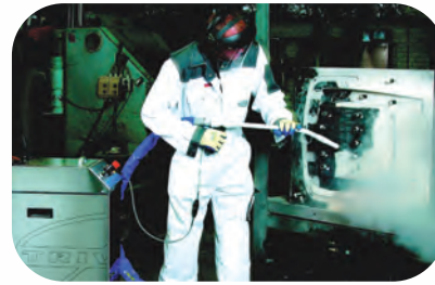
industrial mold cleaning